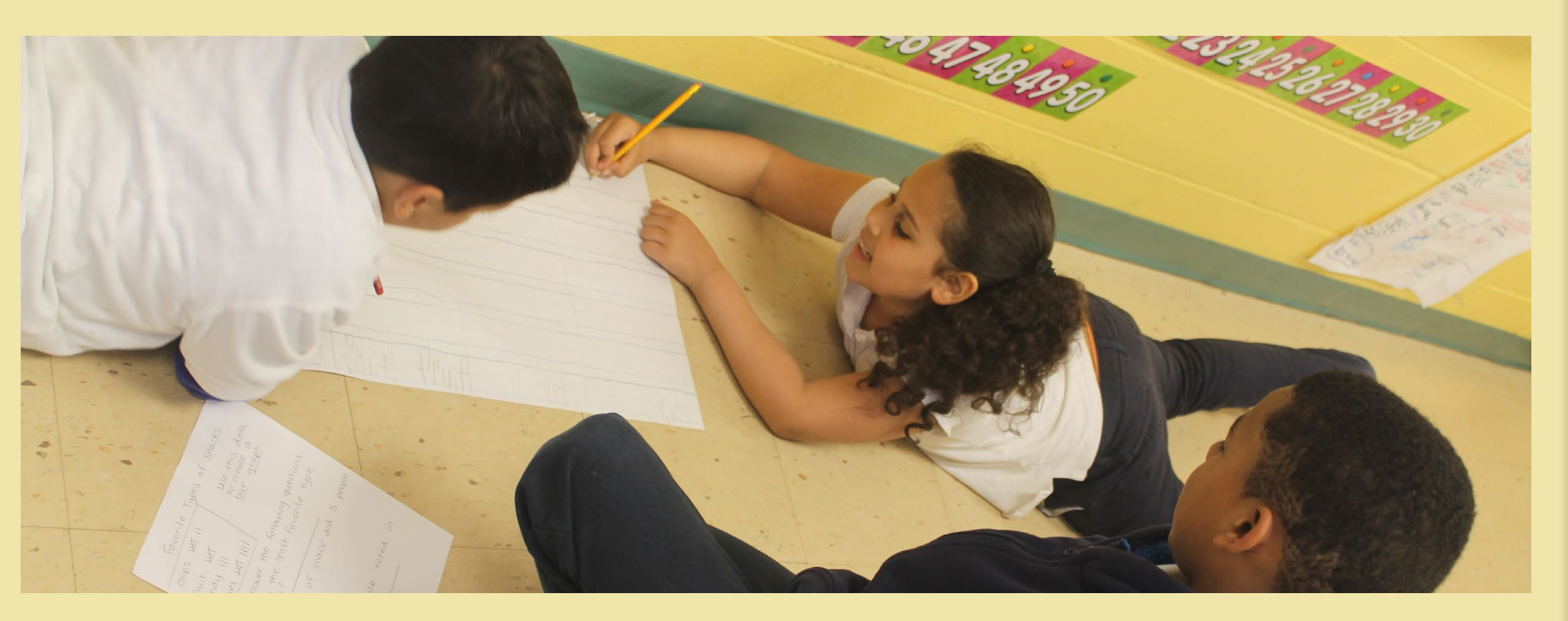
One of the most powerful influences on an individual's future success in school and life is having sustained opportunities for learning in supportive and enriching environments from infancy through age eight.

And yet, educators who work with children in early grades—kindergarten and Grades I and 2—know that the only way to consistently lead students to achieve proficiency in high standards is by having structures in place that form a solid